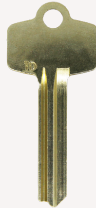
Medeco B Keyblanks