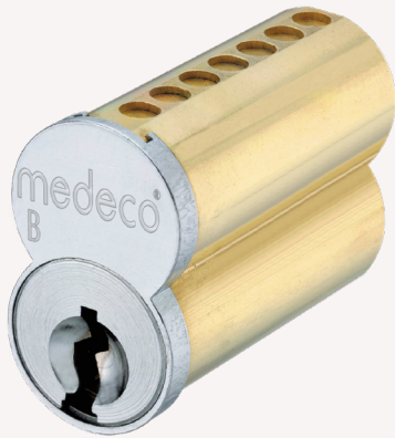
Medeco B Cores